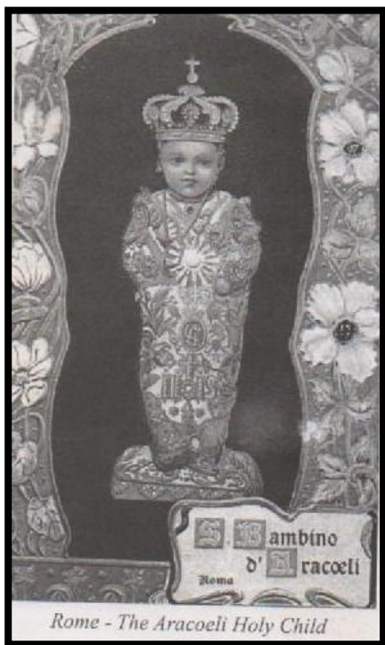
Rome - The Aracoeli Holy Child